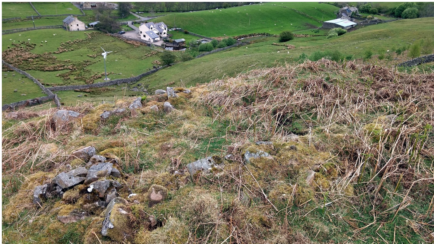
Photograph 5 Feature I