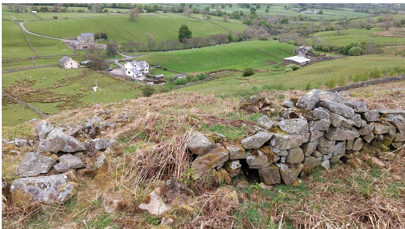
Photograph 4 Feature H