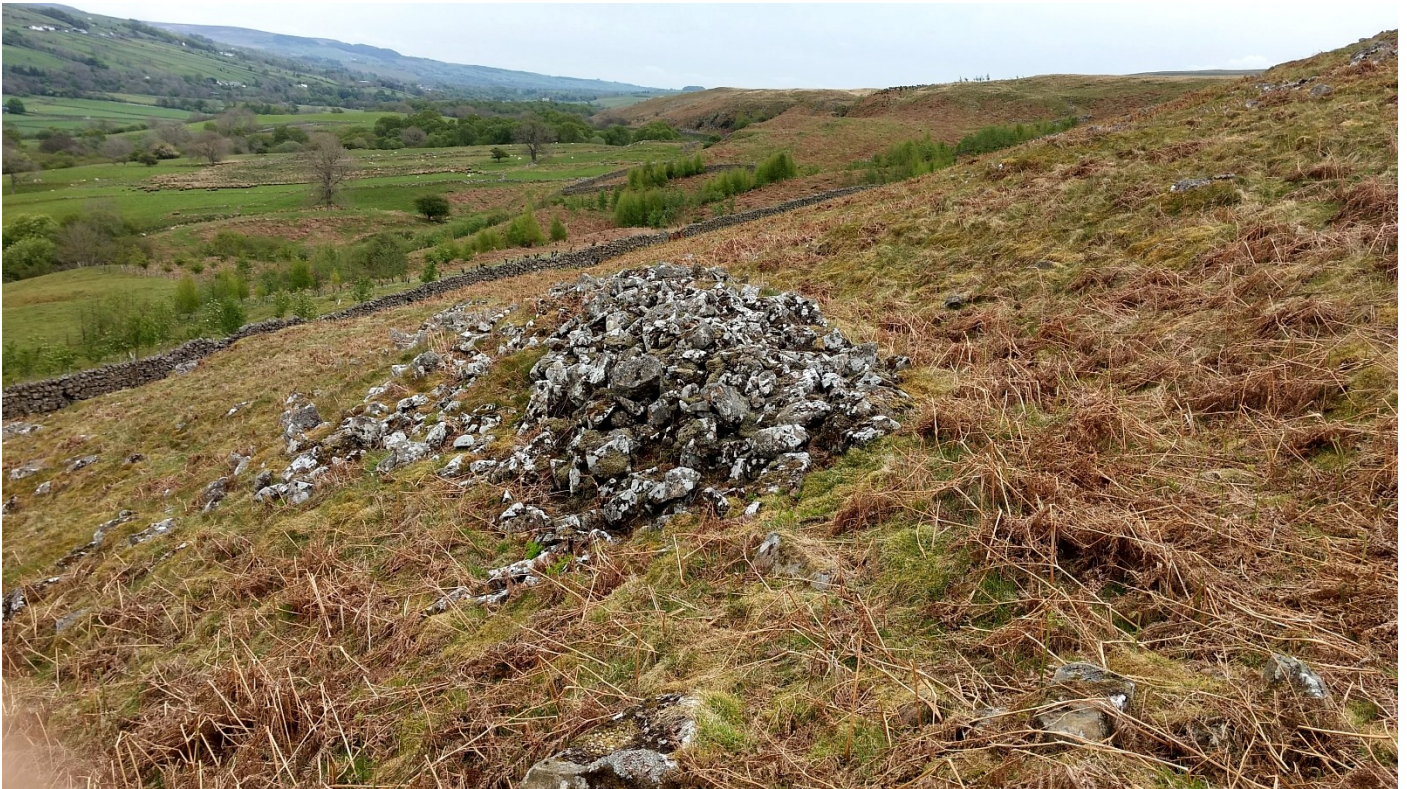
Photograph 1 Feature B