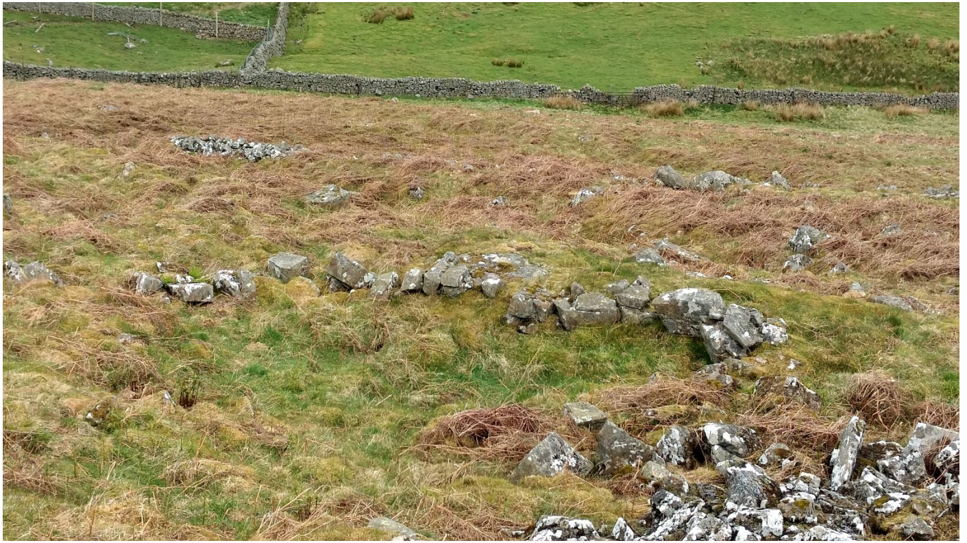
Photograph 7 Feature K