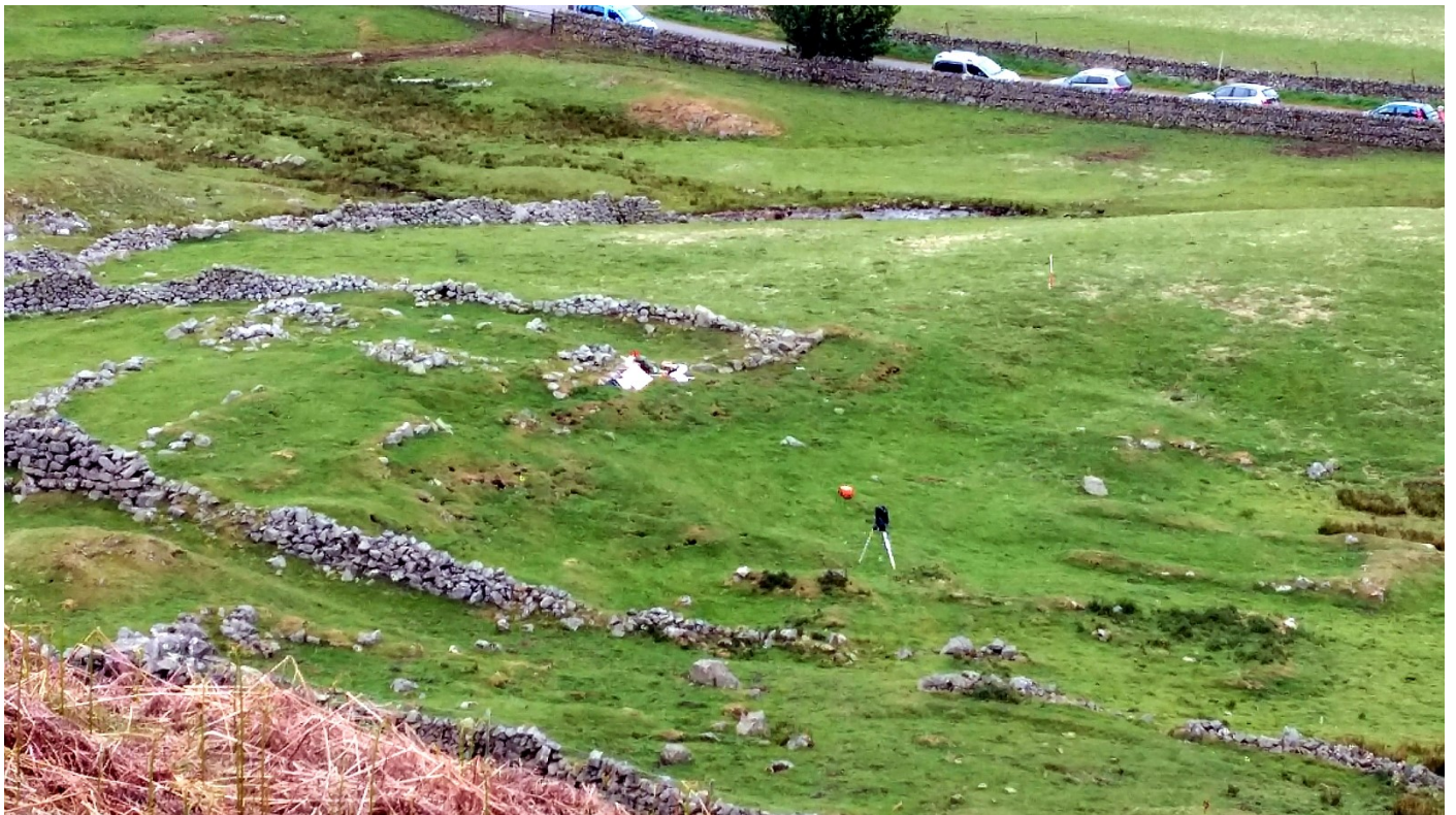
Photograph 8 HolwickDS from Monument 1019458