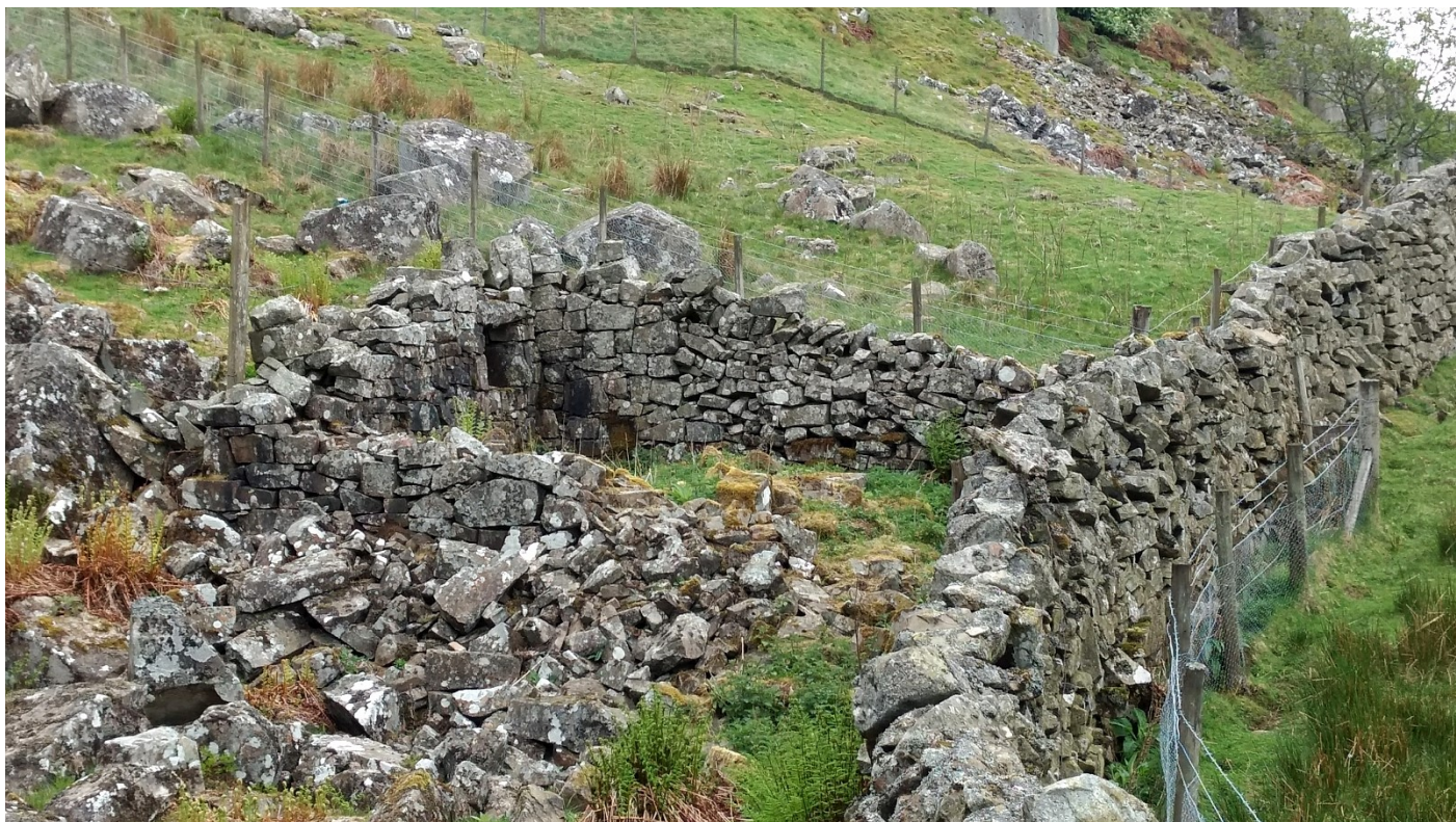
Photograph 8 Feature M