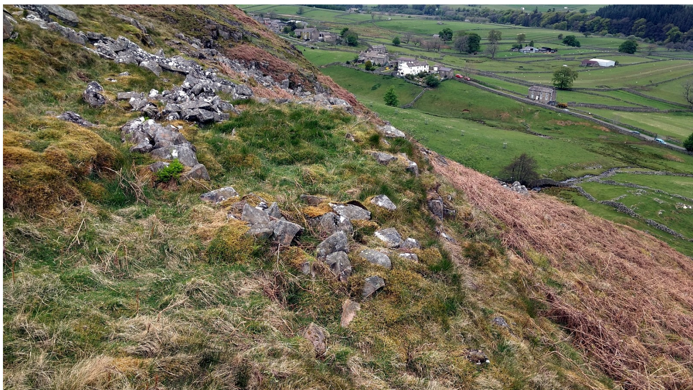
Photograph 6 Feature J