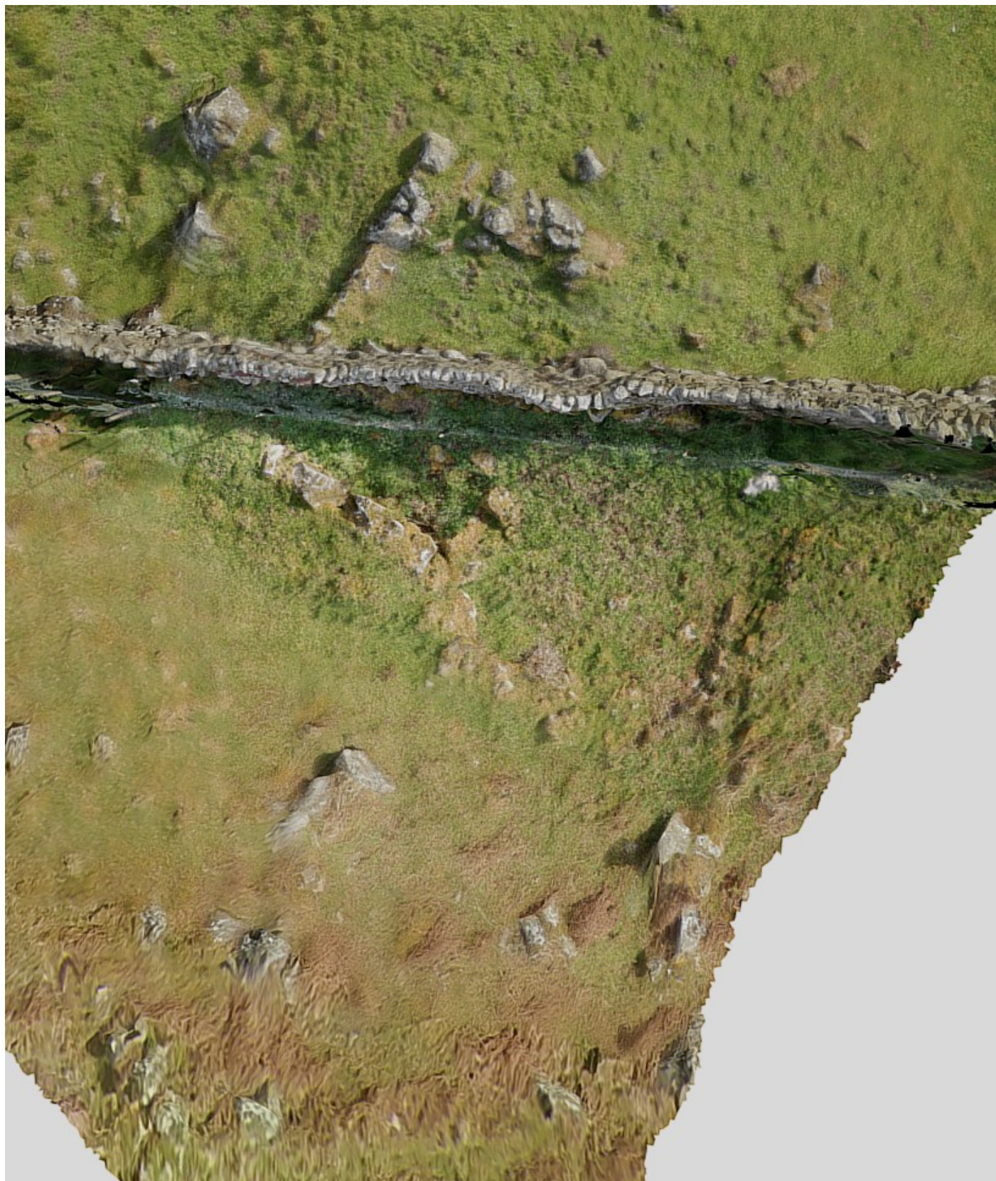
Photograph 7 Feature L that forms part of a house platform in the HolwickDS site above the dry-stone wall.