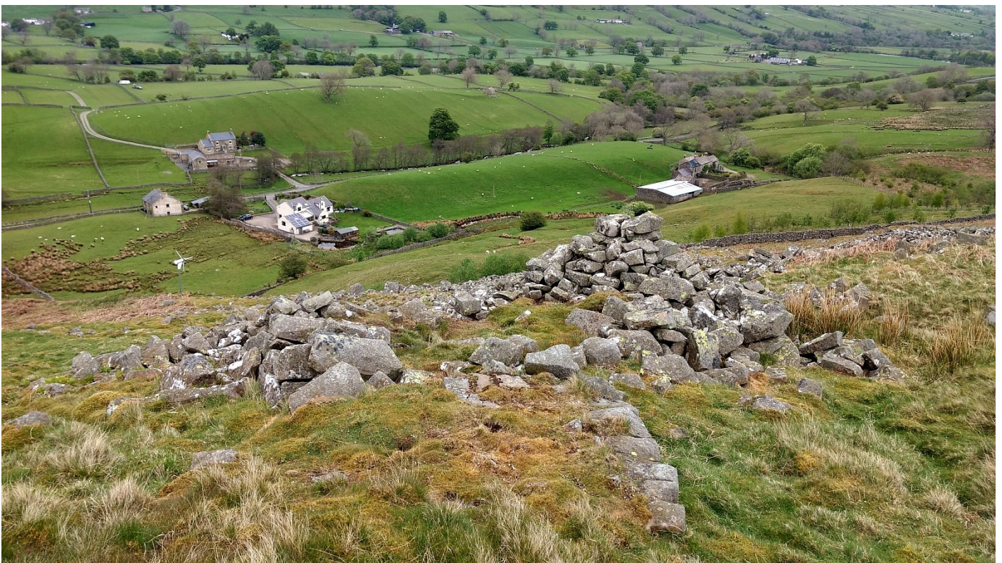
Photograph 2 Feature G with small annex or enclosure in foreground