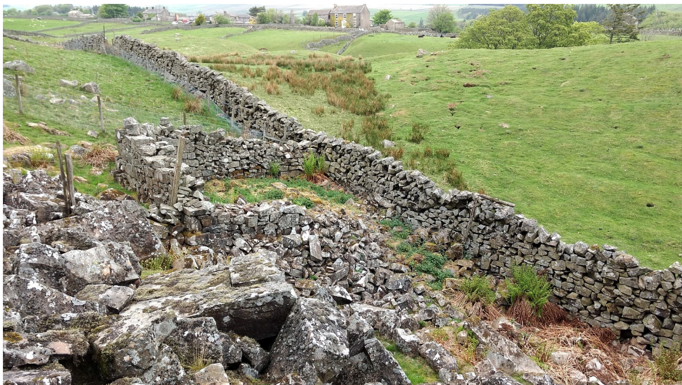
Photograph 9 Feature M