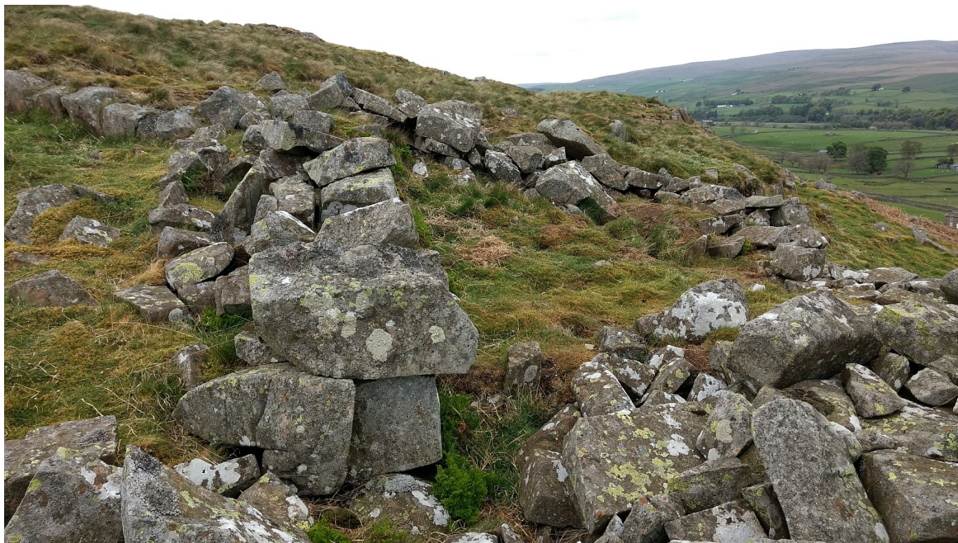
Photograph 3 Feature G