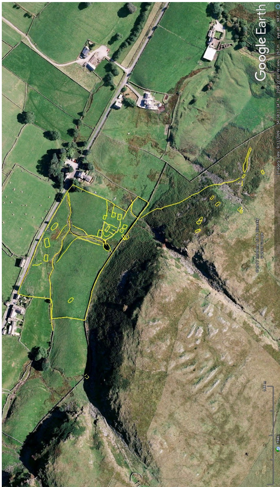
Figure 2 Google Earth view of Holwick Scars Scheduled Monument and Holwick Deserted Settlement